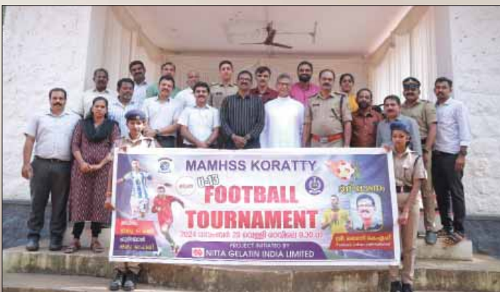
Sports coaching camp at MAMHS KORATTY