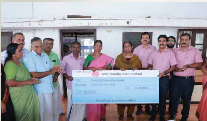
Support for play ground at Kadukutty