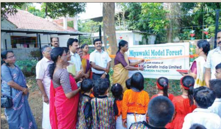
Inauguration of Miyawaki model forest at UPS Kathikudam