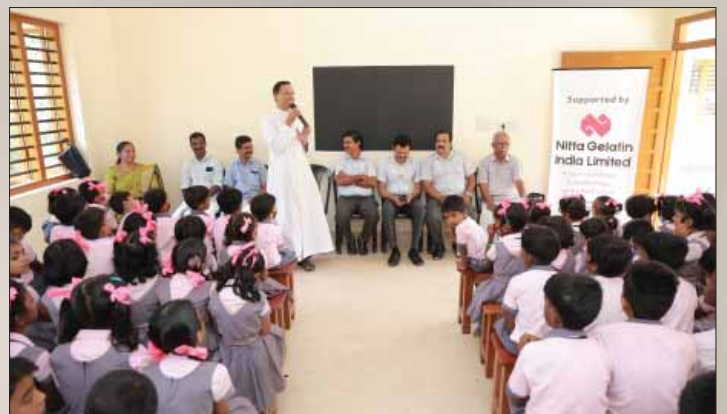
Construction of class room at St. Joseph LP School Muringoor