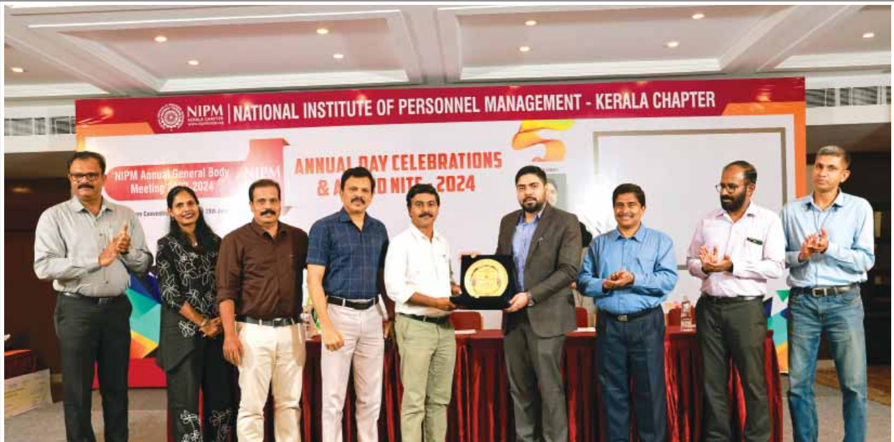
NIPM Award for CSR