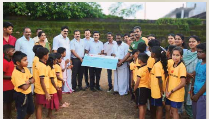
Nitta's CSR Initiative: Sports Coaching Camp at Annamanada Grama Panchayath – Nurturing Young Talent and Promoting a Healthy Lifestyle