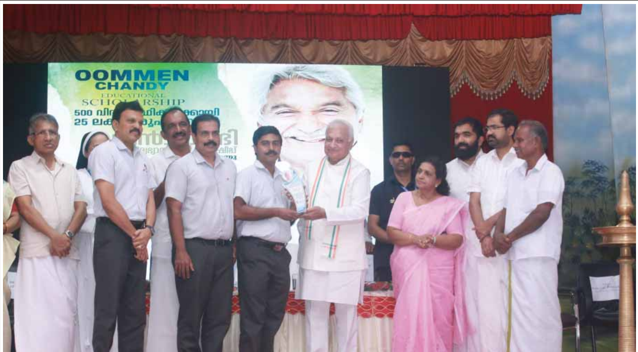
Kerala Governor honours Nitta for Exemplary CSR Initiatives in Chalakudy – A recognition of commitment to Community Development and Social Responsibility