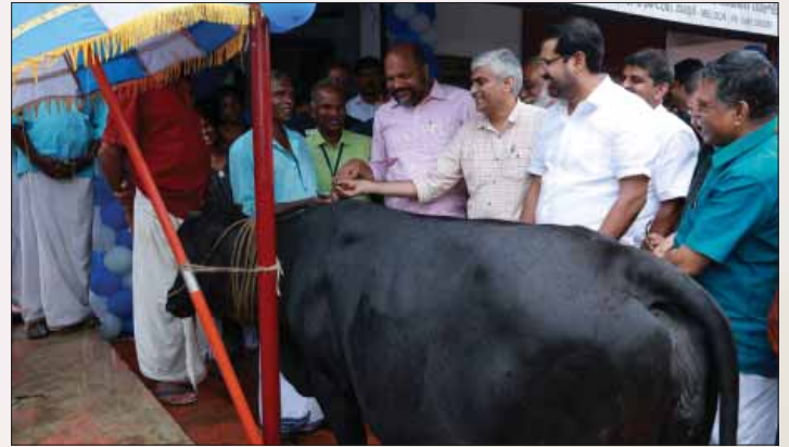
Nitta's CSR Initiative: Milch Cow Distribution at Meloor Farmers Club, Muringoor – Empowering Local Farmers with Livelihood Opportunities through Sustainable Income Generation.