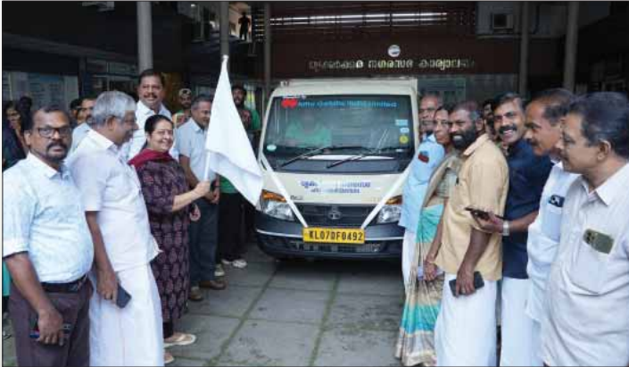
Empowering Clean Communities Vehicle Donation for Household Plastic Waste Collection in Thrikkakara Municipality