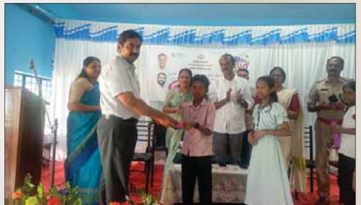
Distribution of Study Materials to Local Schools – Supporting Education and School Reopening Efforts