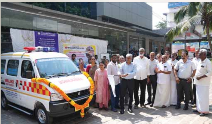
Supporting Community Healthcare - Donation of an Ambulance to Thrikkakara Co-operative Hospital, Thrikkakara