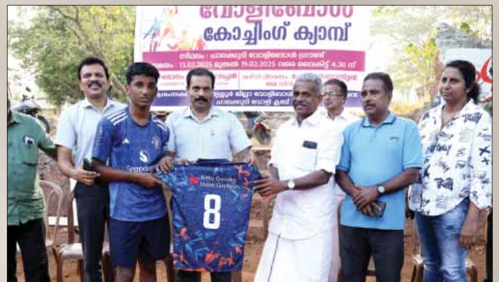
Volley ball coaching camp at Chalakudy